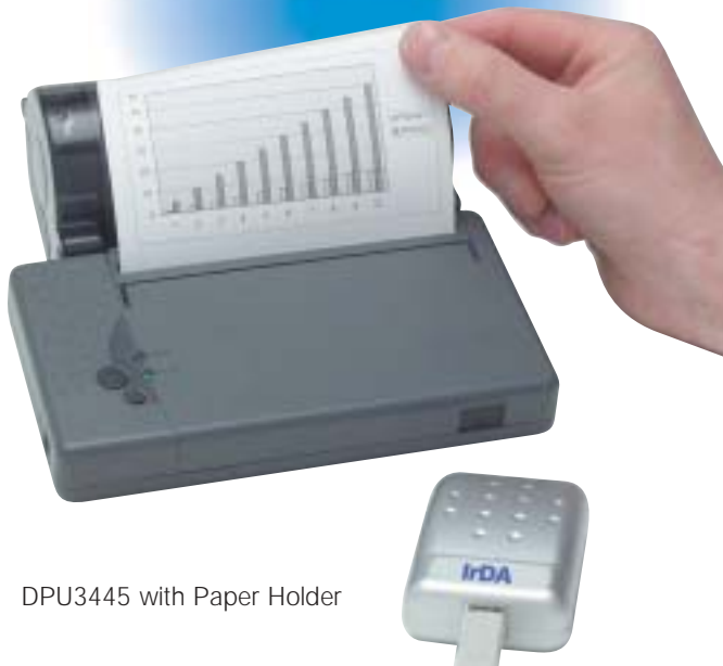
DPU3445 with Paper Holder